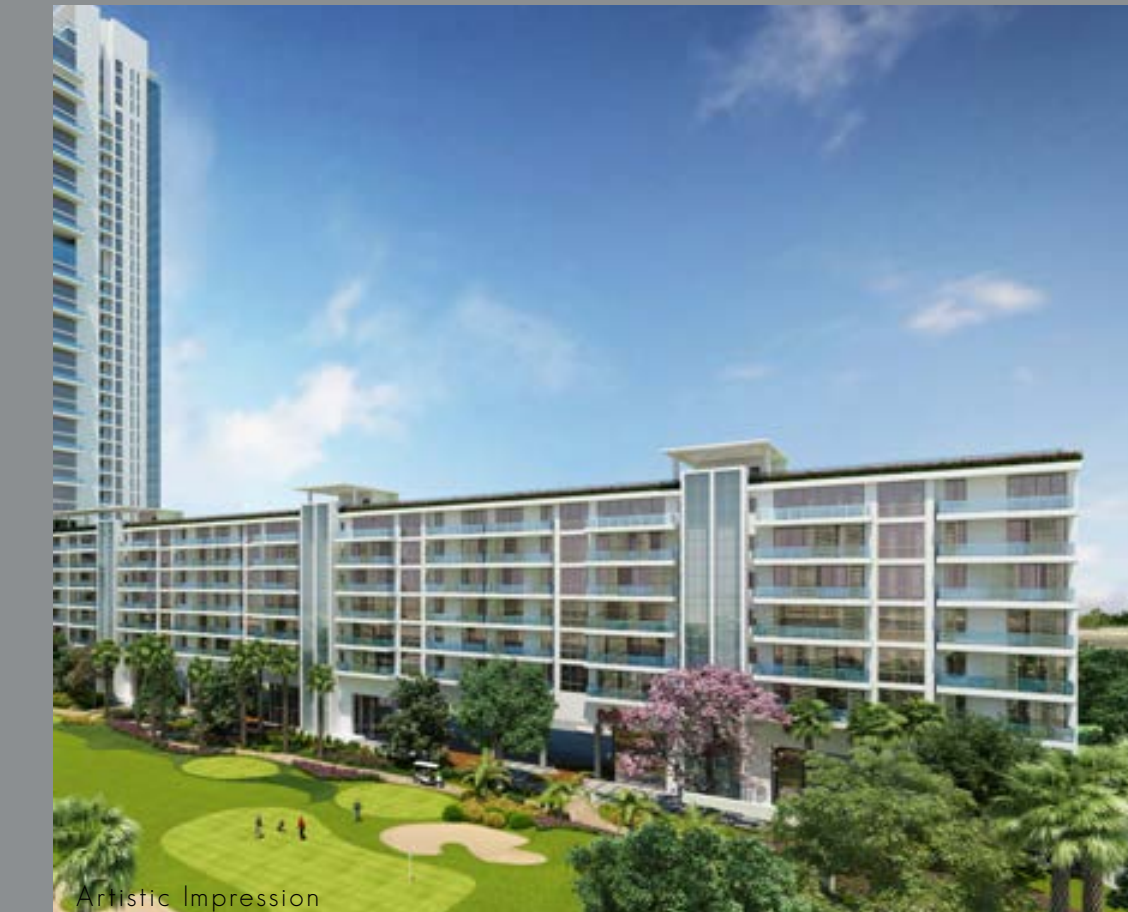
MEM PANORAMA GOLF COURSE ROAD EXTENSION SECTOR-65, GURUGRAM