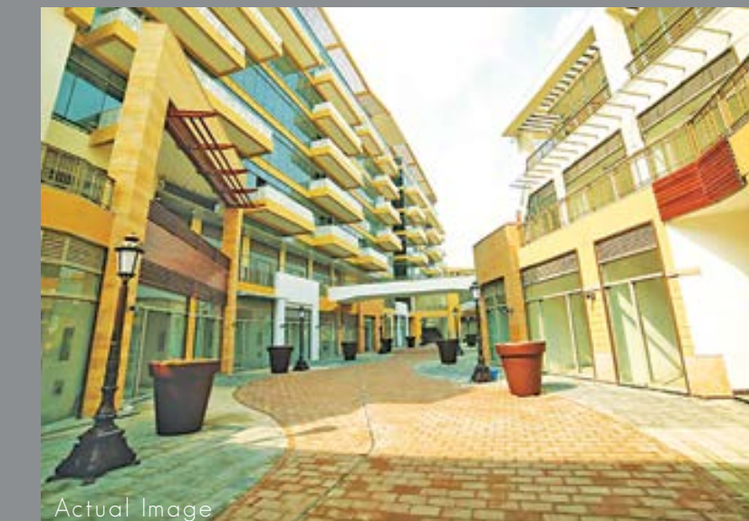
URBANA The Latest in the Evolution of Urban Business & Retail SECTOR-67, GURUGRAM