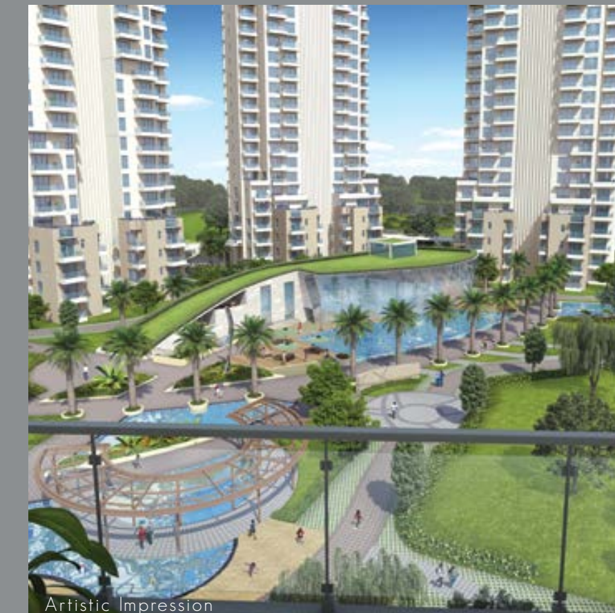
Merlin SINGAPORE STYLE WORLD CLASS APARTMENTS