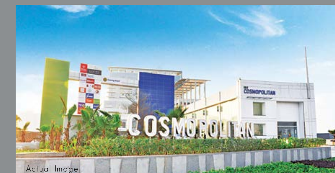
M&M COSMOPOLITAN STYLISH RETAIL & COMMERCIAL HUB SECTOR-66, GURUGRAM